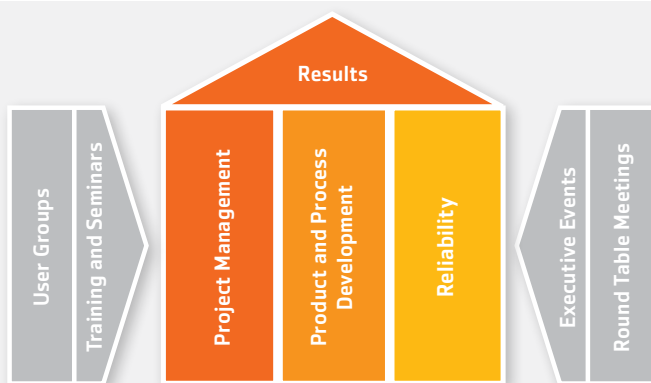
The Holland Innovative House: ■ ■ ■ core ■ results ■ enablers

Reliability guidelines in collaboration with the University of Stuttgart and consists of several modules that will result into a VDI Reliability Engineer certification.